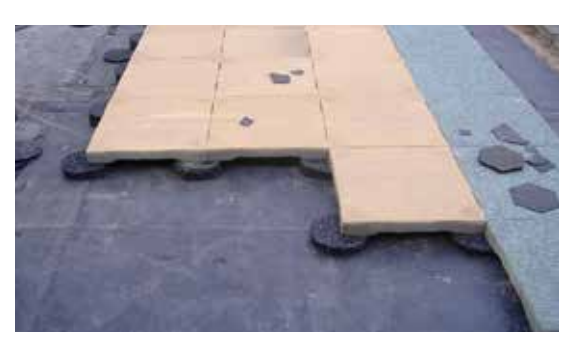
Dreen® Slab: Laying fixed height system