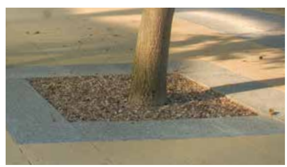
Tree demarcation with Dreen® Slabs