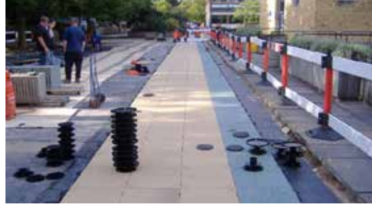
Dreen® Slab: Laying adjustable height system